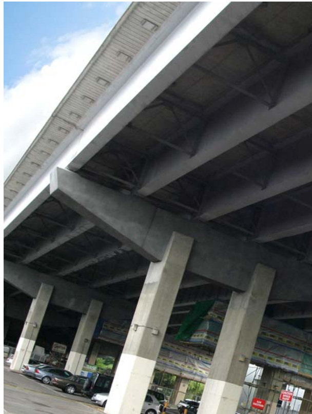
Loudwater Viaduct during works

Hyder Consulting recommended repairs to the spalled areas of concrete followed by the design and installation of an impressed current CP system for all cross head beams. CRL used scaffold to access all 22 beams under the viaduct which carried the M40 over